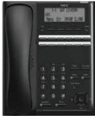
12 Button Digital Telephone