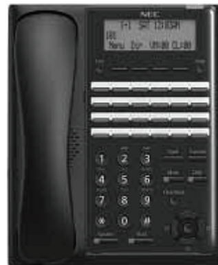
24 Button Digital Telephone